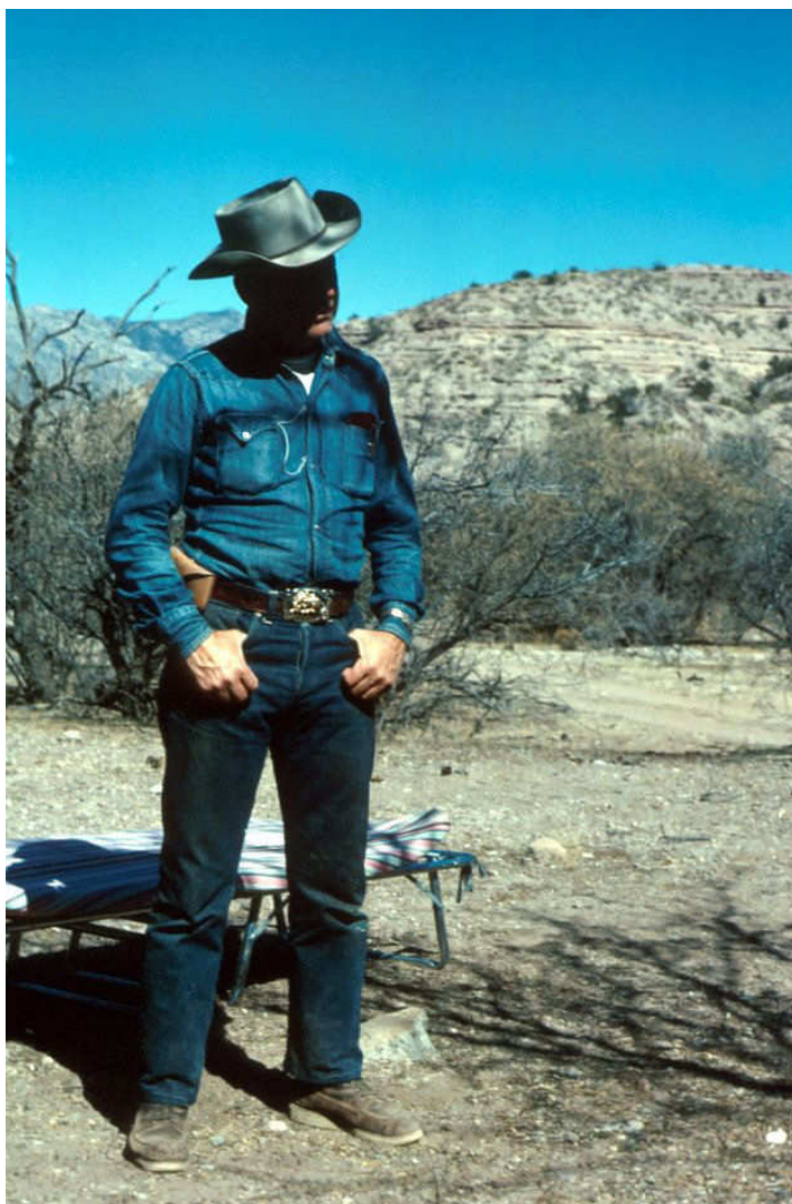
MORE THAN A PROPHET

God visited this generation - with more than a prophet - with a messenger with a message, to forerun the second coming of Jesus Christ.