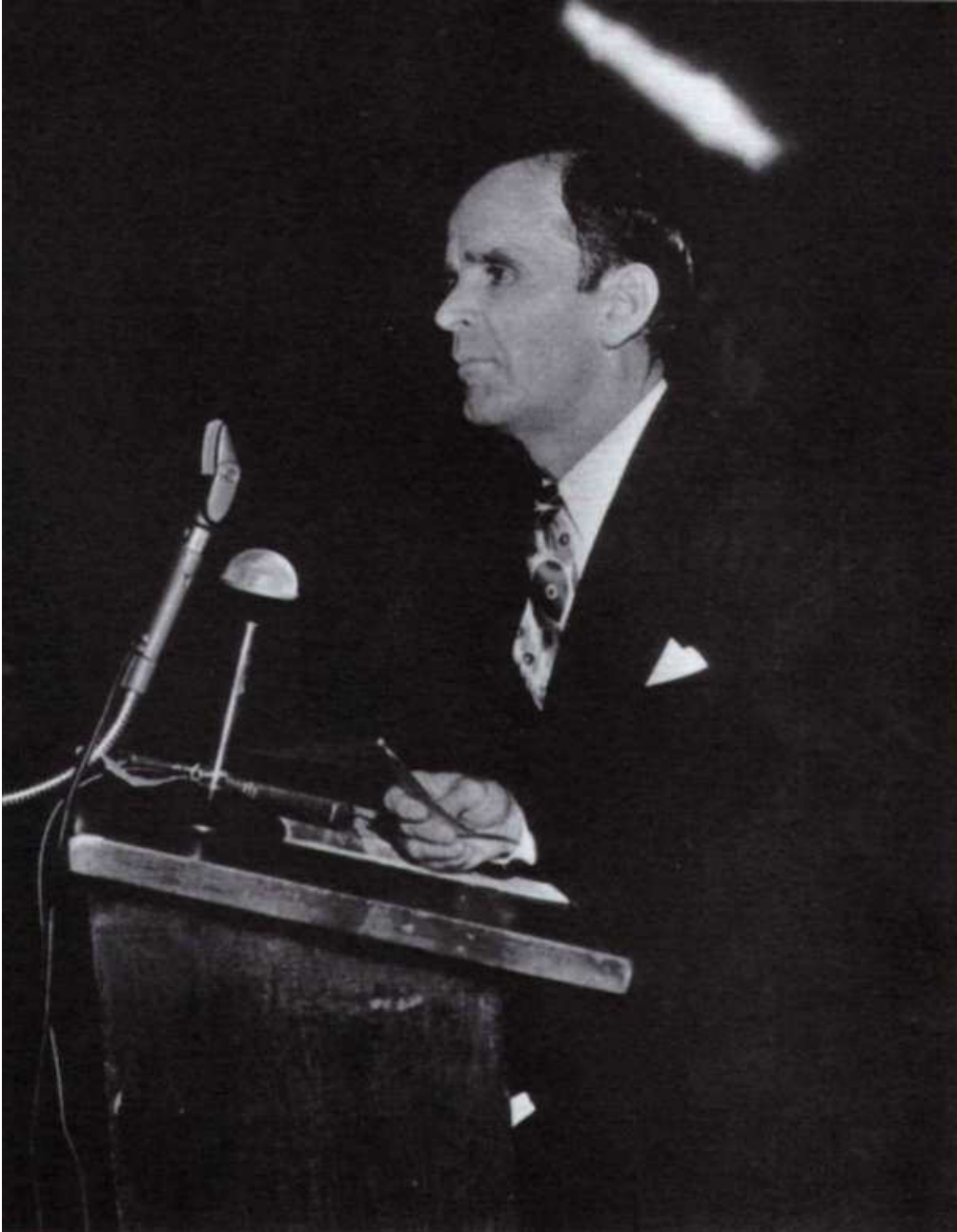
THE PILLAR OF FIRE OVER THE PROPHET A camera record of a supernatural light-see page 86.