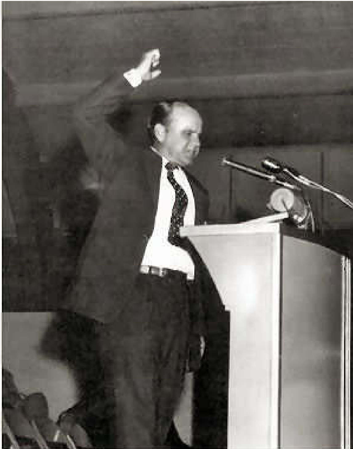
DRIVING A POINT HOME