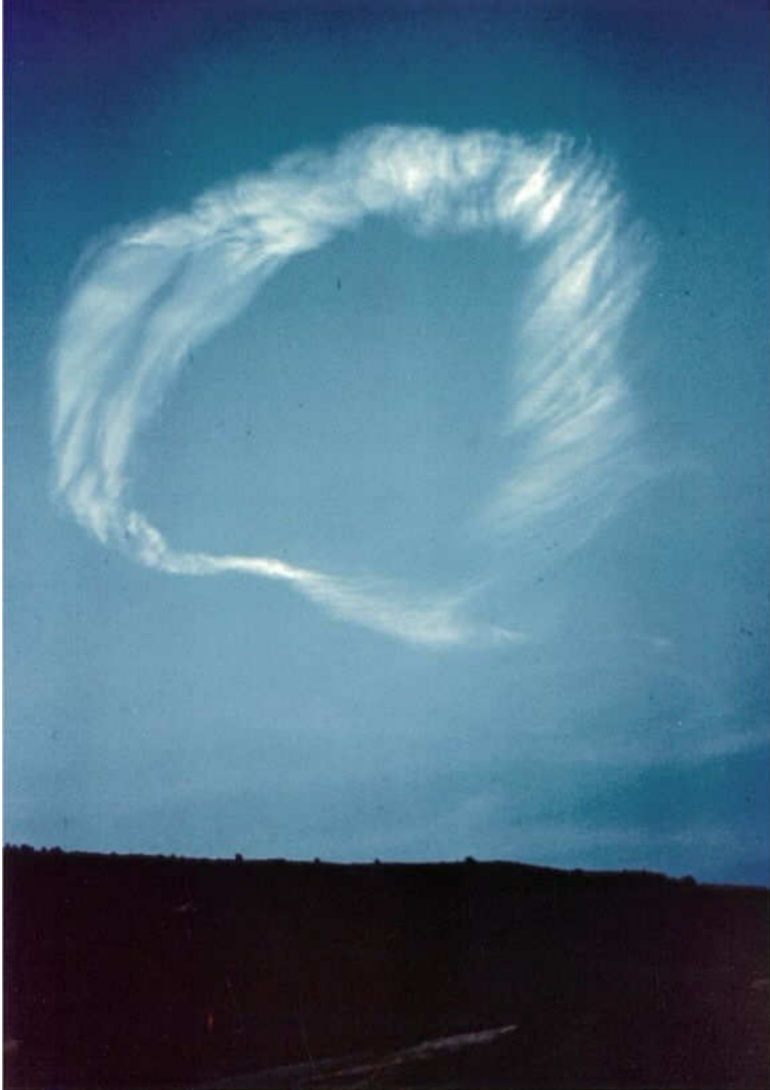
THE CLOUD No scientific explanation.

midst, and leaving him, formed this cloud. I have no reason to doubt this explanation. The cloud was too big, too high, and would have to contain too much moisture to be real; but the fact remains - it was real. It was also beyond the real. It was supernatural and God sent it as a sign to the Bride.