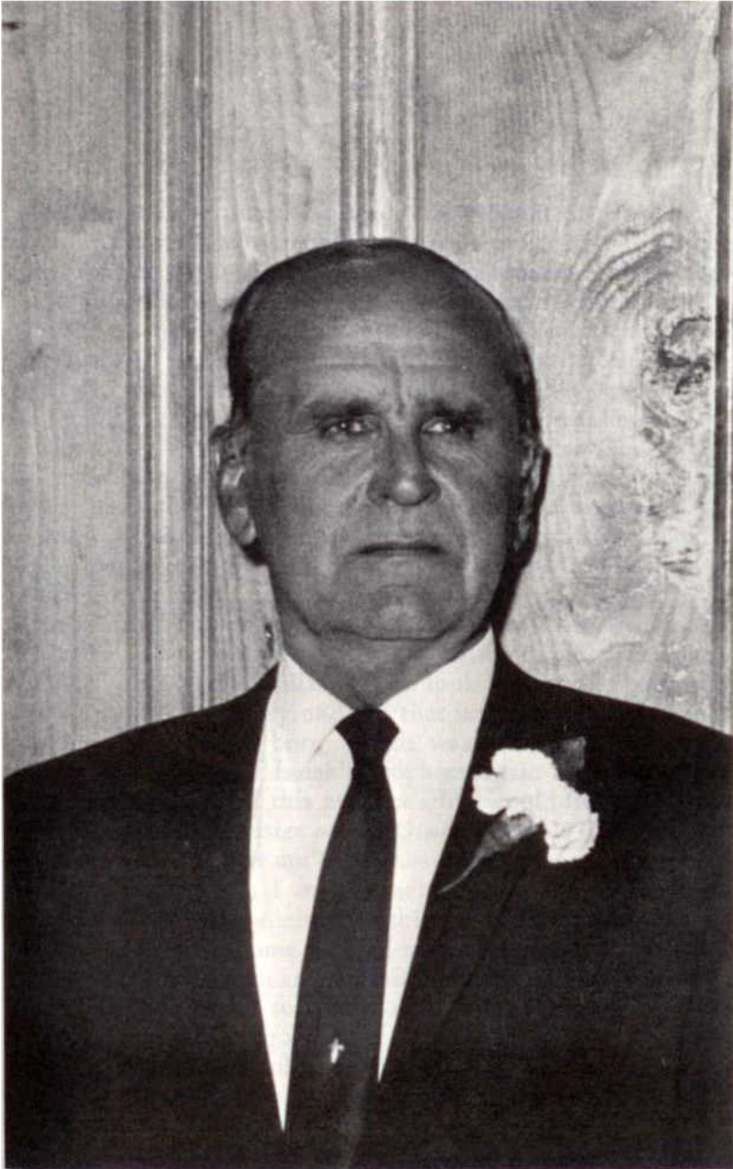
WILLIAM MARRION BRANHAM Prophet to the Twentieth Century